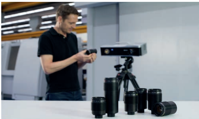
The right sensor for every application:

The high-performance software platform colin3D ensures a consistently efficient and project-oriented procedure during the entire measuring process.